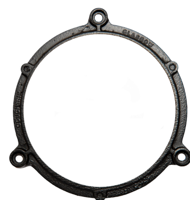
SWC Retaining Ring AD.62