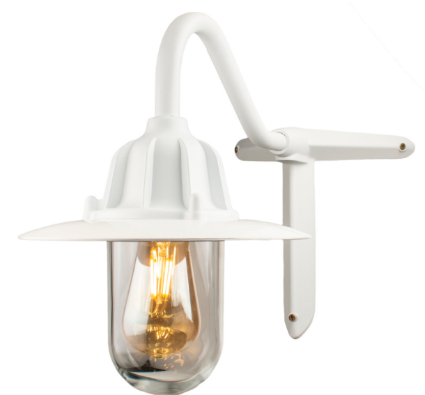
White Corner Mounted & Reflector