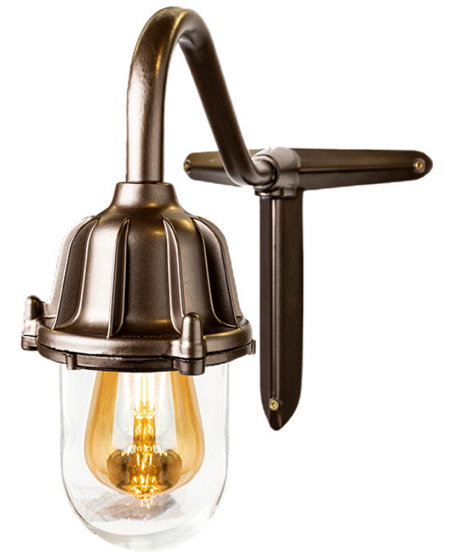
Antique Bronze Corner Mounted