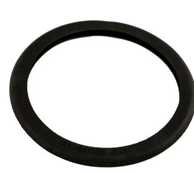
SW Gasket E.863