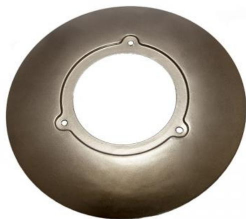
Antique Bronze Reflector AD.63