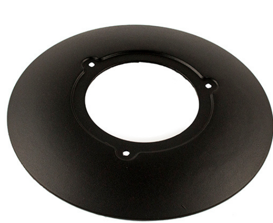
Black Reflector AD.63