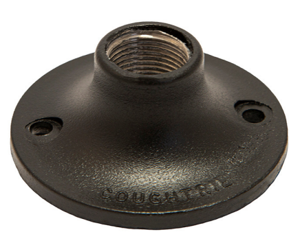
Wall Mount C.417