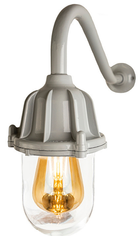
Grey Wall Mounted