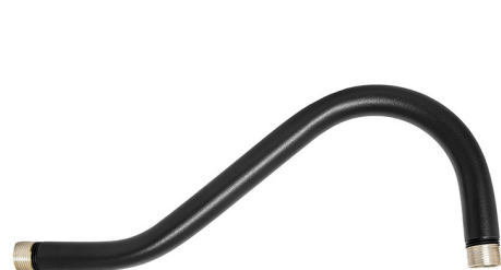
Swan Neck V.4912