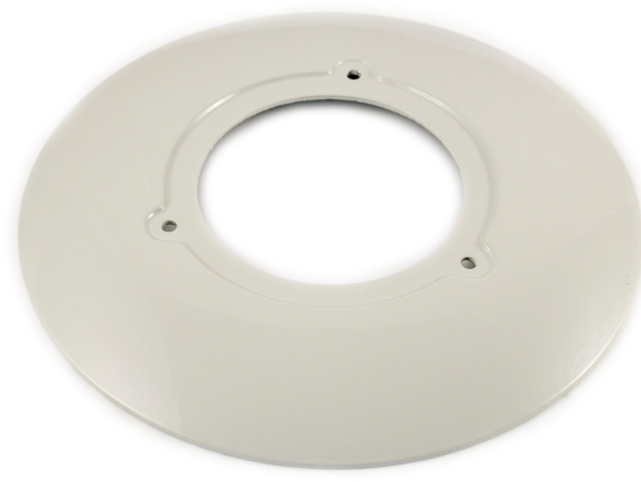
Grey Reflector AD.63