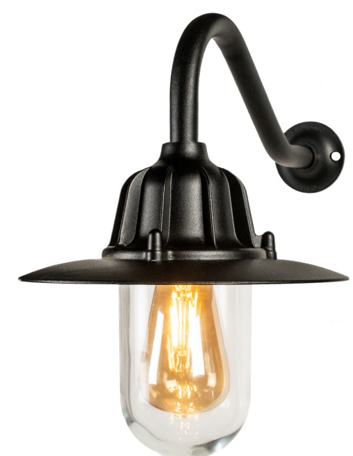
Black Wall Mounted & Reflector