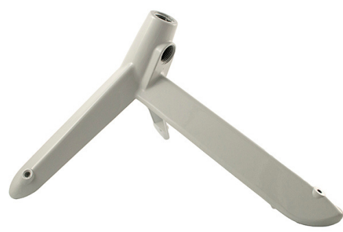
Corner Bracket L.2420