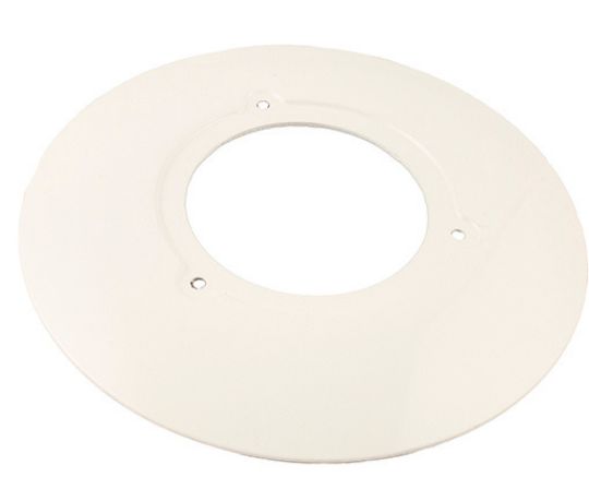
White Reflector AD.63