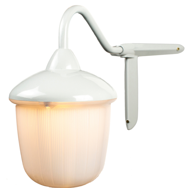
Grey Corner Mounted