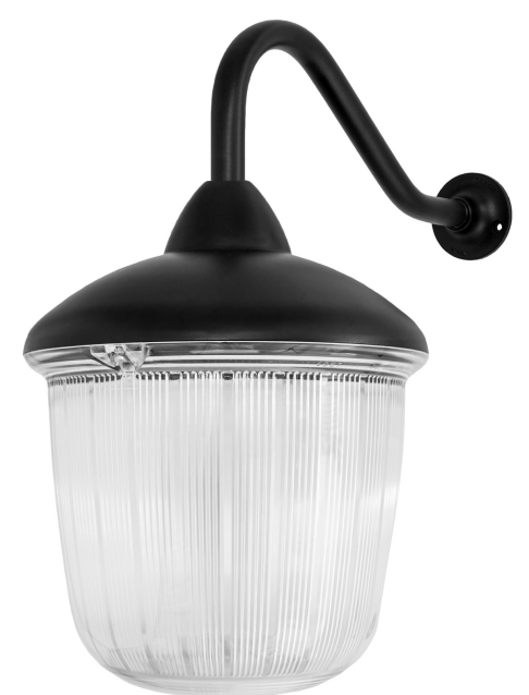
Black Wall Mounted