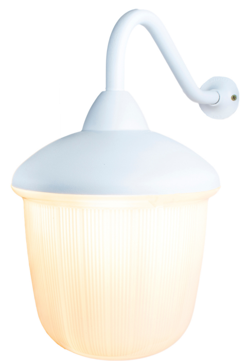
White Wall Mounted